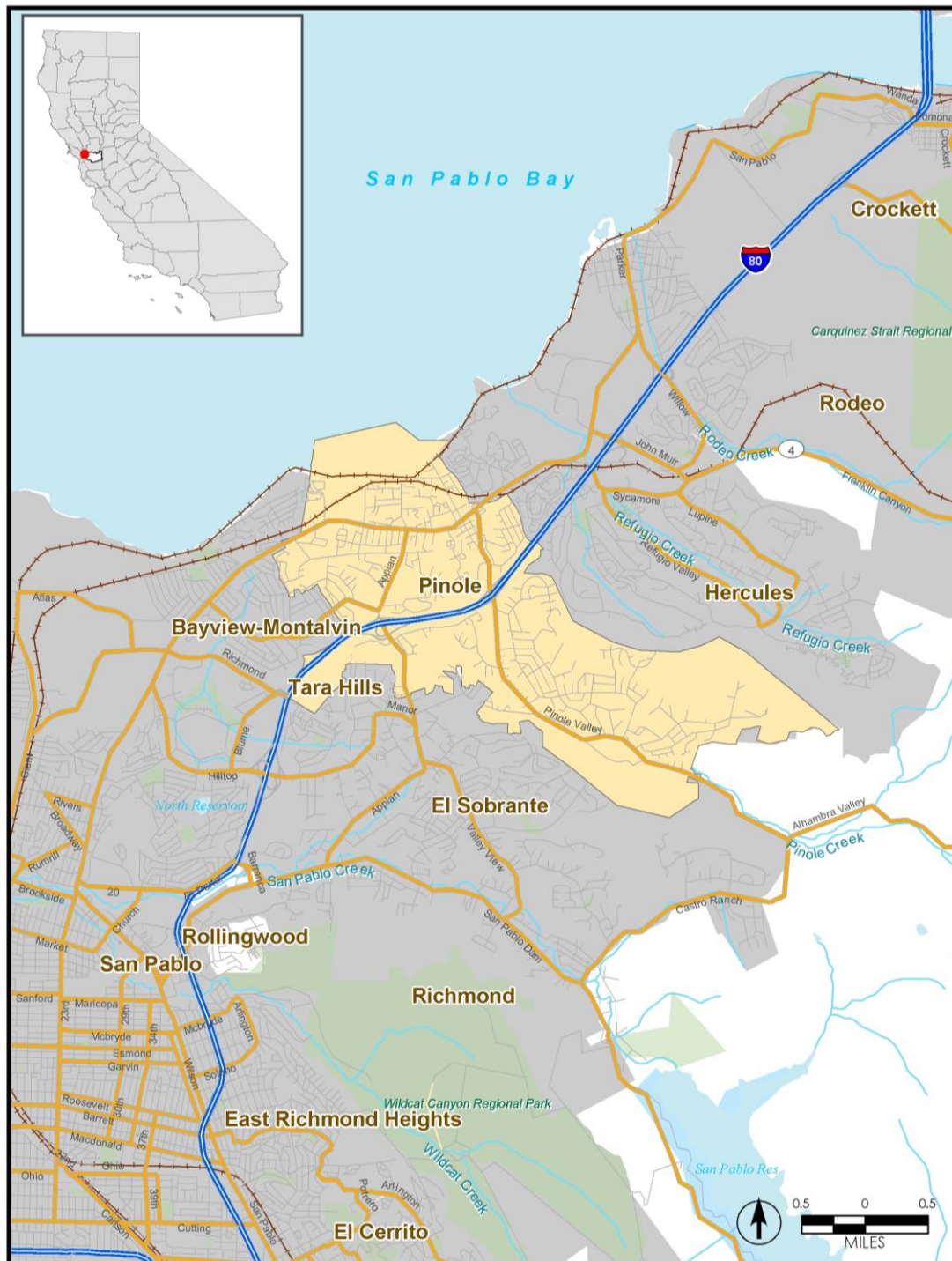
Figure 1.1 Regional Location Map