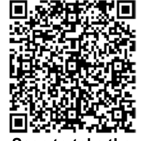
Scan to take the survey today!

Land Use Planning survey today, and find out more about the Land Use Planning Pinole for project www.landuseplanningforpinole.com.