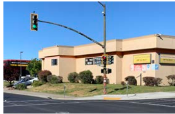
New ADA complaint curb ramps