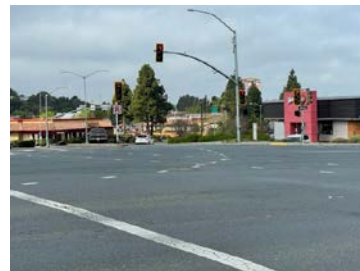
Northbound Appian traffic turning left onto Fitzgerald Drive.