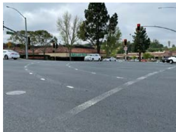
Eastbound Fitzgerald Drive traffic turning left onto Appian Way

Lane striping has been added to enhance traffic safety for the northbound Appian Way traffic turning left onto Fitzgerald Drive in addition to westbound traffic turning left onto Appian Way.