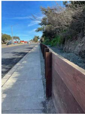
Wood Wall (East of Belmont Ave.)

Next steps involve completion of punch list items. The resources required for the project will be demobilized and the worksite will be cleaned up. Final construction project records will be prepared, and a Notice of Completion will be filed with the Contra Costa County Clerk.