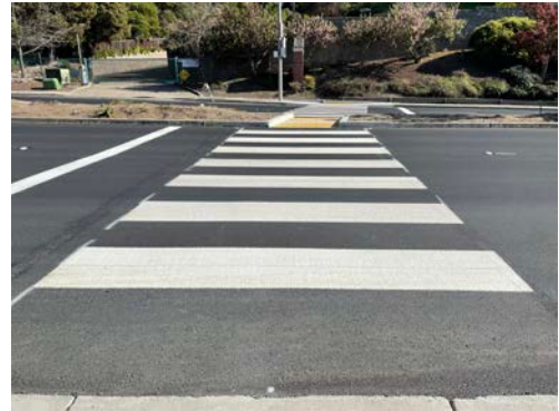
New Pedestrian Continental Pedestrian Crossing at 655 San Pablo Ave.