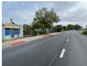
New Red Curb