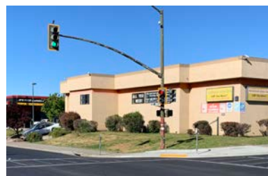
New ADA complaint curb ramps