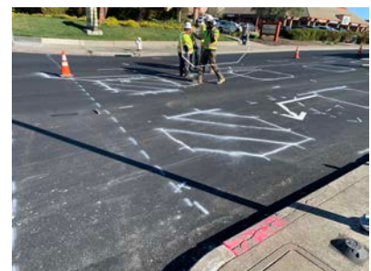
Traffic signal loop detectors