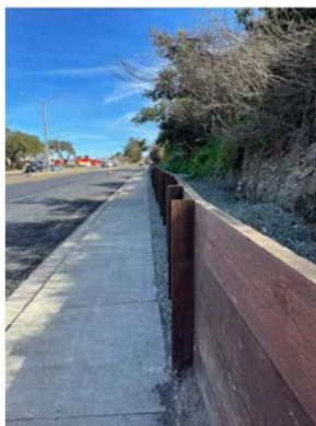
Wood Wall (East of Belmont Ave.)

The City of Pinole awarded a contract to MCK Services, Inc. for the project. To date, the ADA curb ramps upgrades have been completed at intersections between the project limits. A wood wall was installed east of Belmont Ave. to provide erosion control and clear sidewalk for pedestrians. Pavement rehabilitation work is complete. Traffic signal loop detectors have been installed and all utility boxes located in the roadway have been raised. New striping will start this week. The anticipated completion date of the entire project is Spring 2022.